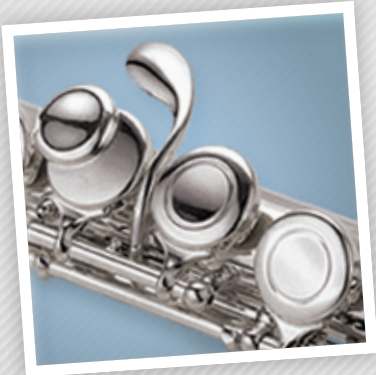
Assisted fingering keys allow smaller hands to play with better hand positioning improving overall technique and playing comfort.

Only Jupiter provides a diverse flute selection for the smaller player, perfect for a variety of applications. Jupiter's unique Assisted Fingering Key system features offset finger buttons to reduce the normal hand spread, making flute playing more comfortable.